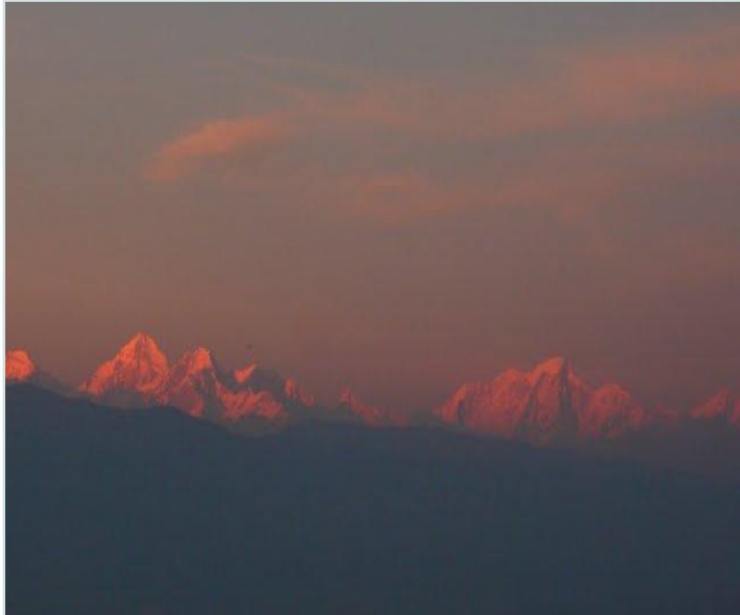
Sunset on the Himalayas