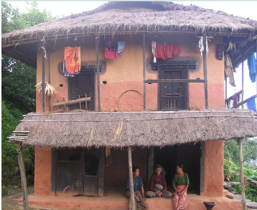
A typical Nepalese house in the hills