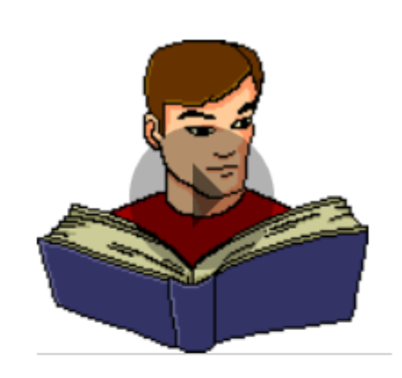
available from: http://www.animatedgif.net /bookscalendars /bookscalendars.shtml

Animated gifs can be use to grab attention, but they can also be irritating, so should be used sparingly.