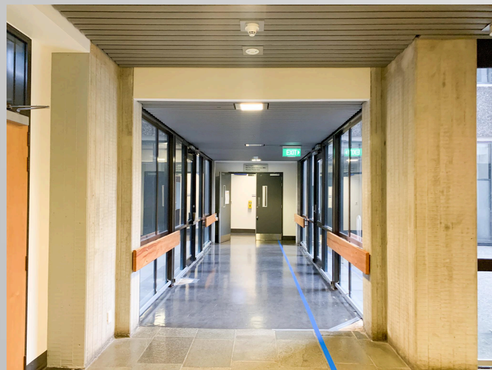
Entrance to Building 502