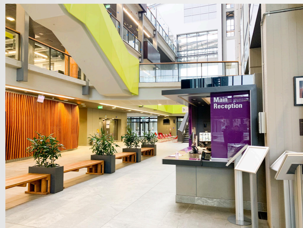
Find the Main Reception