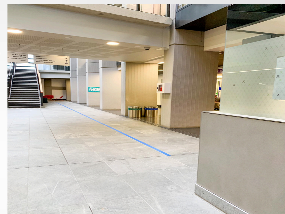
Find the start of the blue line behind Main Reception