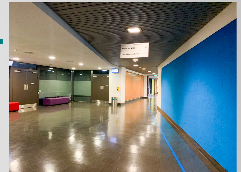
Building 503, follow the blue line until the end