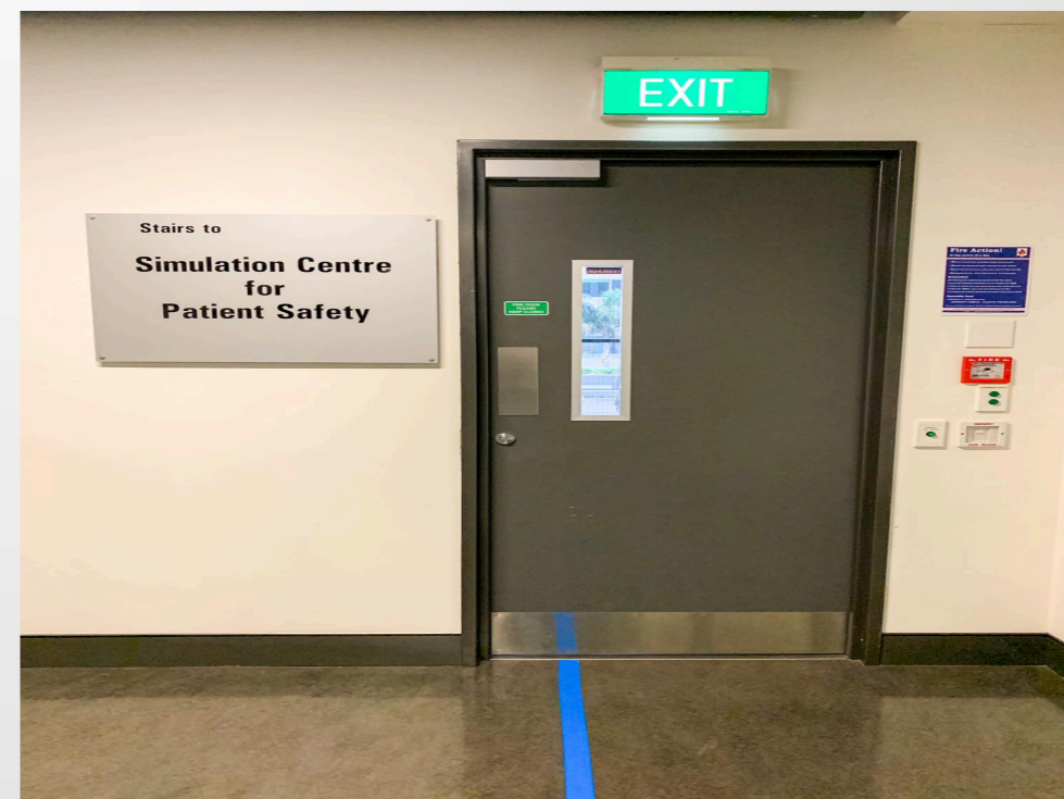
End of the blue line, stairs going to SCPS