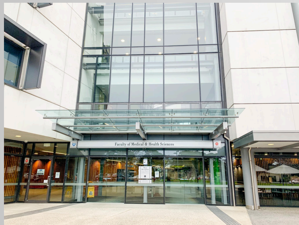
Go to Grafton Campus Main Entrance