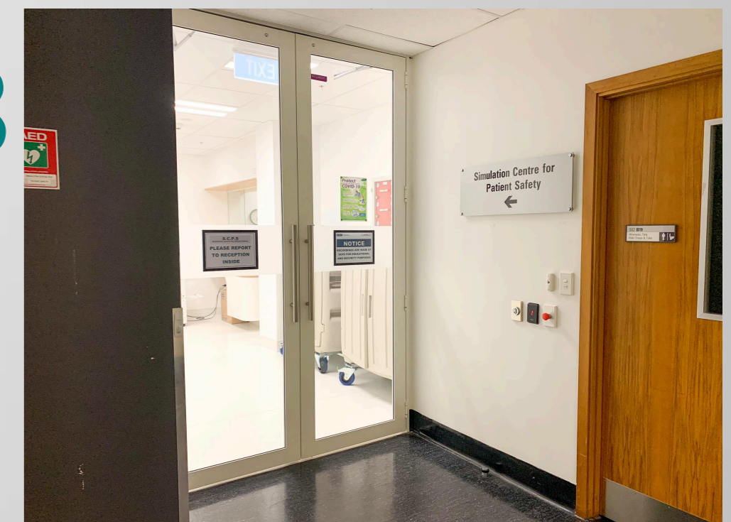
After taking the stairs, SCPS entrance on the right